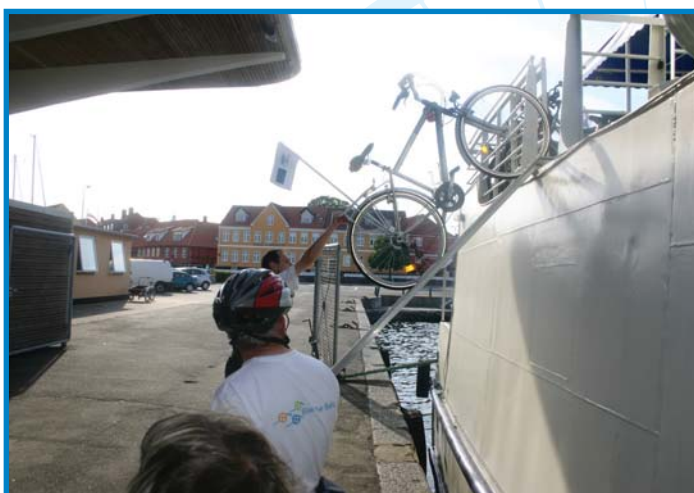
23 small scale investments (12 rest places and 11 family recreation places) are ready for tourists.

The project activities result in supporting the sustainable development and promotion of the South Baltic Region, by creating a joint cross-border bicycle thematic route “Vikings and Slavs – in search for a common heritage”.