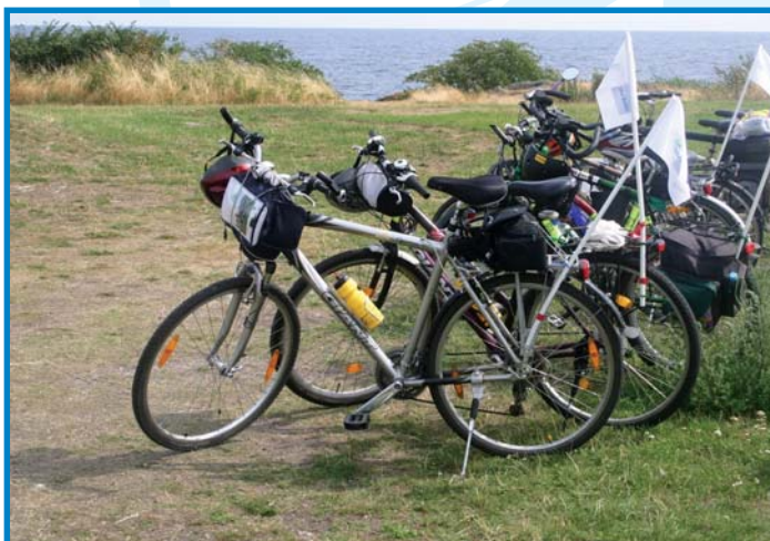
They cycled along the Bike the Baltic route in Poland, Scania and on Bornholm. Bike The Baltic – www.bikethebaltic.com