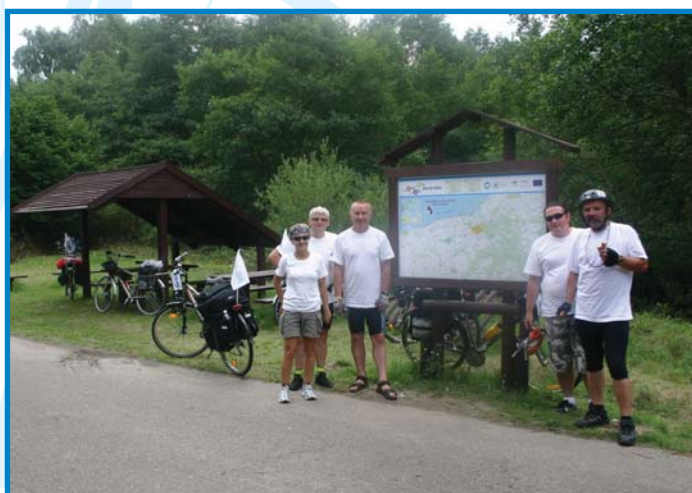
The group of cyclists made a successful, bicycle trip.