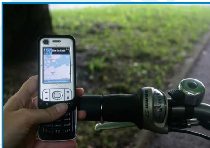
During the trip they tested the GPS mobile applications using different mobile phones. Historical guide books have been published in four languages (English, Polish, Swedish and Danish).