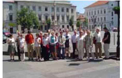
Seagull S.C. at the central square in Győr