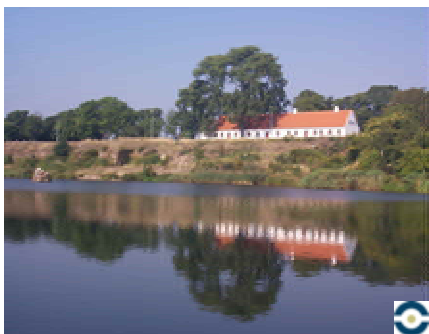
Centre for Regional and Tourism Research.